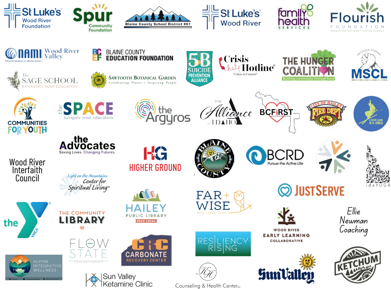
Nearly 50 local nonprofits, law enforcement agencies, government entities and corporations are working in tandem through the Blaine County Mental Well-Being Initiative.