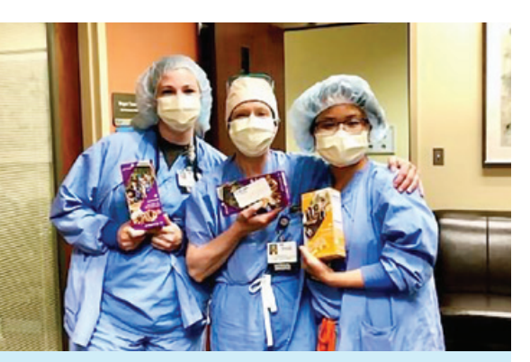
Staff pose with their favorite cookies.